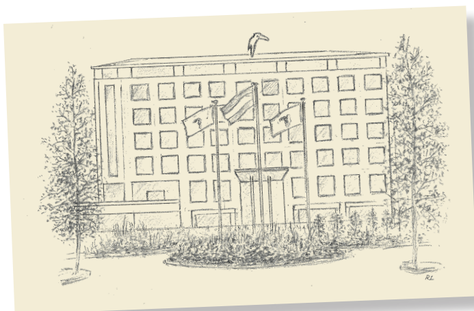
Ink drawing by R. Langebeek